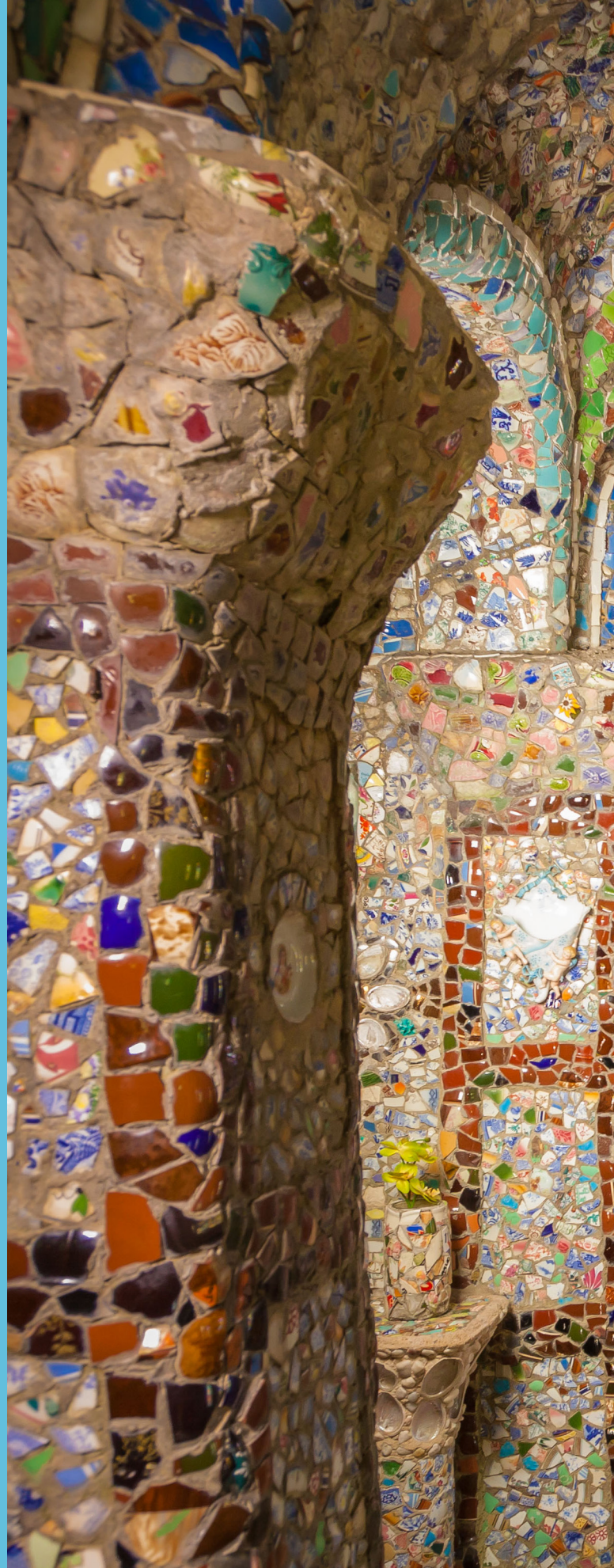
The Little Chapel