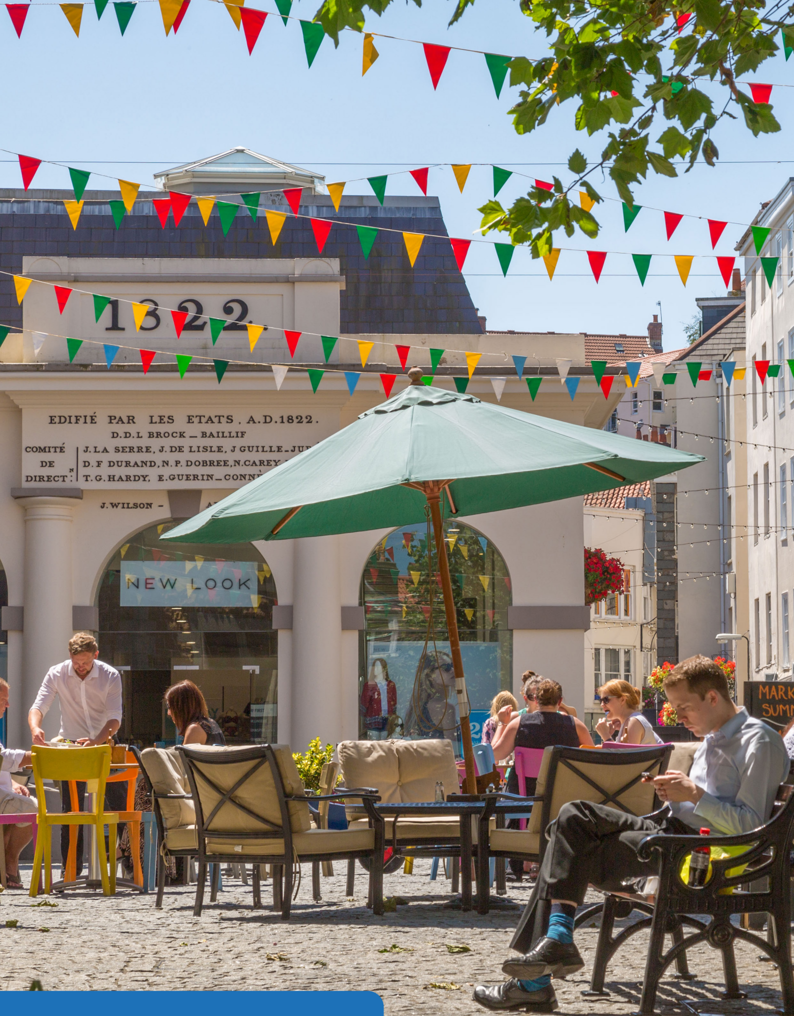
Market Square, St Peter Port